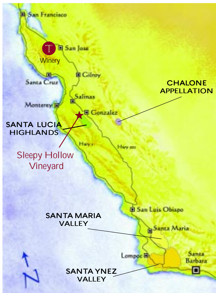
California Central Coast

The Wine Spectator – January 2000 Annual Pinot Noir Report